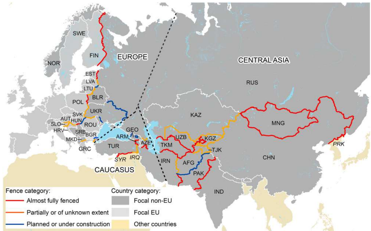
Fig 3. Extent of border security fencing along national borders in Europe and Central Asia.